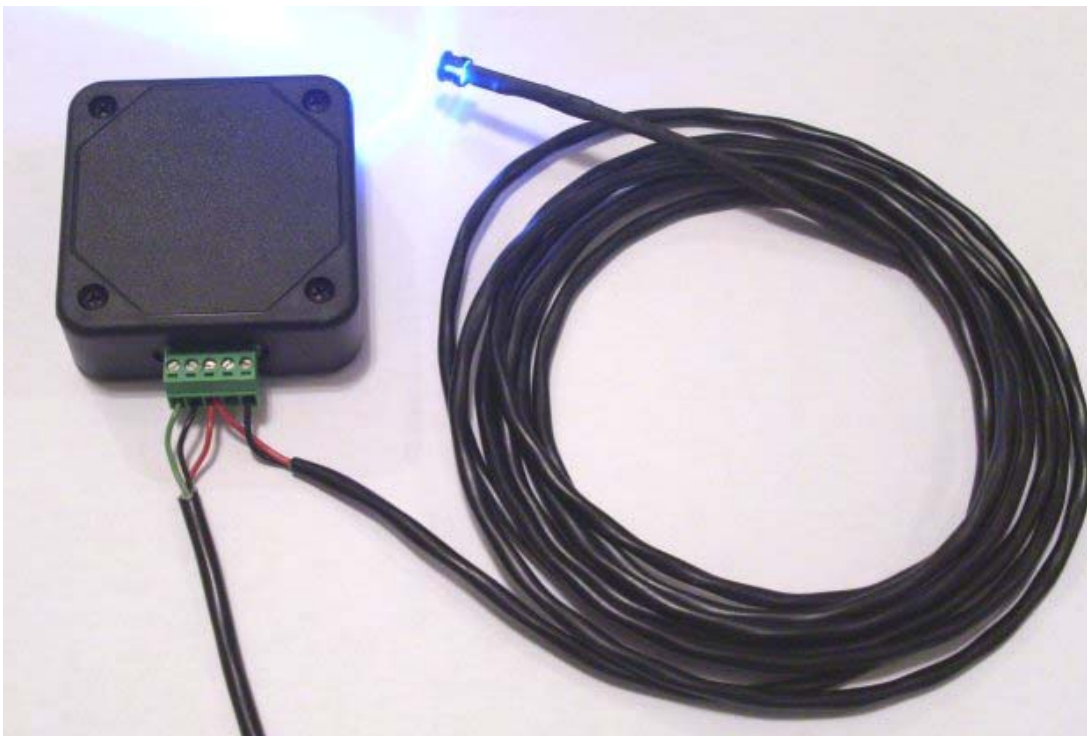
Typical Wiring Application with Single LED