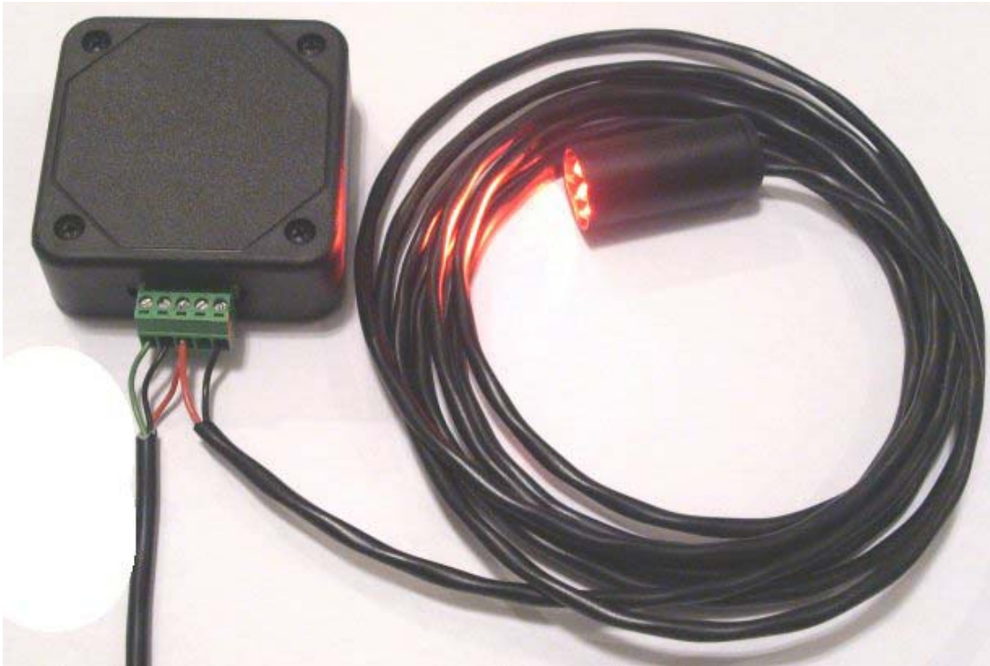
Typical Wiring Application with Raptor Warning Light